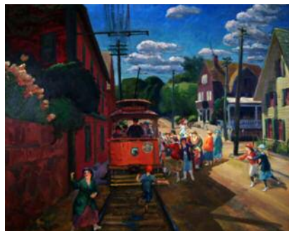
Right: The Gloucester Trolley , c. 1916, by John Sloan, oil on canvas, 26 x 32 in. Arkell Museum, Canajoharie, NY.