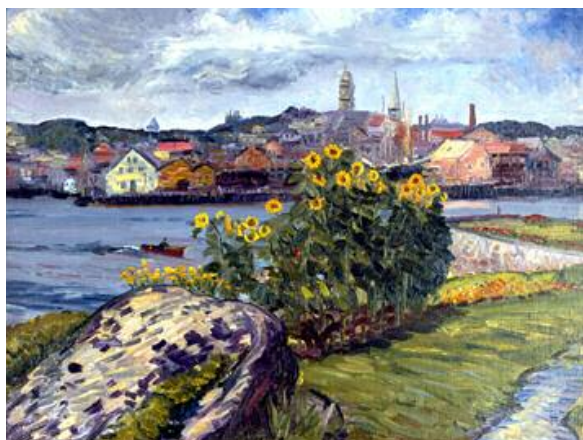
Sunflowers on Rocky Neck , 1914, by John Sloan, oil on canvas, 19 x 24 in. Cape Ann Museum collection.

Below: Current site photo of The Red Cottage.