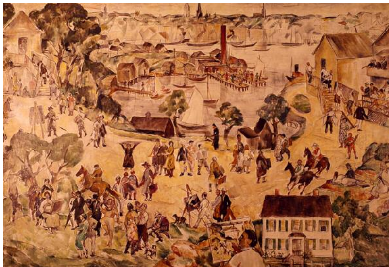
Gloucester Humoresque , by William Meyerowitz. Oil on canvas, 36 x 52 in. Cape Ann Museum collection.

From the end of Rte. 128 (second traffic light) go straight up over hill. Follow East Main Street 1.1 miles. Turn right onto Rocky Neck Avenue. No. 1 Eastern Point Road is on the left corner. Public parking lot is just a short distance on the right.