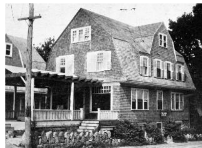
Summer guest house, 1 Eastern Point Road, E. Gloucester, c. 1919 , black and white photograph. The building remains relatively unchanged today.